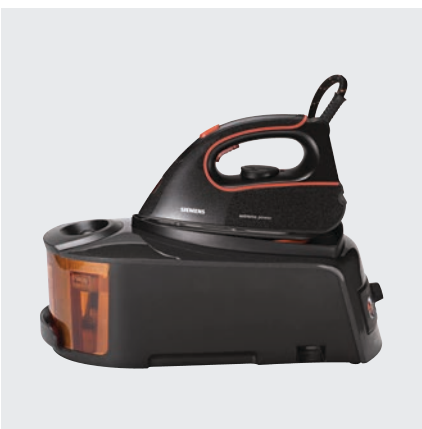
ALCOM® in electrical and electronic applications

ALCOM® Metallic Effect provides a high-quality appearance without visible weld lines or flow marks – but most importantly without time-consuming painting and the associated post-processing operations and costs. Our technology creates tinted metallic compounds for challenging design and construction concepts in every conceivable color variation.