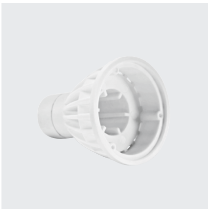
ALCOM® in lamp holders