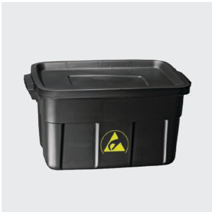
ALCOM® in ESD applications