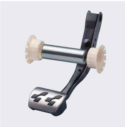
ALCOM® in brake systems

ALCOM® Wear Protect is the ideal material for friction bearings, bushings, gearwheels and numerous other technical components. The addition of wgeneration. Reinforcing fillers guarantee additional high levels of mechanical strength. Even plastic-plastic and metal-plastic friction pairings are possible.